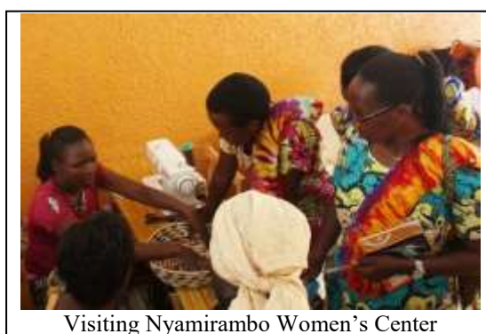
Visiting Nyamirambo Women’s Center

After visiting Azizi Life, the women from Nyanza visited Nyamirambo Women’s Center (NWC) in which the cooperative Umutima is operating. NWC employs women from the community to create a large variety of women’s accessories, children’s clothing, and home decor products. The women from Nyanza visited this center in order to enlarge their understanding on how they can start a handcraft business. The leader of this center shared with the Nyanza group their experience on how they started and their struggles in making the center sustainable. The group visited the shop as well as the workshop to see how the members of Umutima cooperative work.