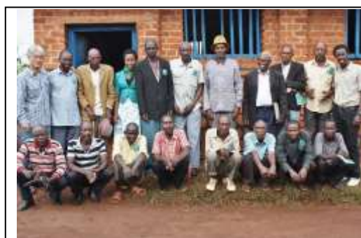
Seminar participants with facilitators

In this seminar, participants understood the importance of apologizing, and they learned how they can sincerely apologize to the genocide survivors who are in the same cooperative or community. It was observed that some offenders did not adequately realize the victims' need of knowing the truth about what happened and having their experience of pain and loss acknowledged properly. In this cooperative, there was 1 female genocide