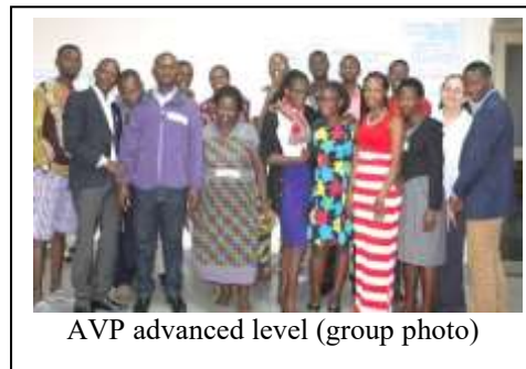
AVP advanced level (group photo)

An Advanced Level Workshop was conducted at PIASS, Huye Campus, on March 17 – 19, 2017, with persons who had completed an AVP Basic Level Workshop, either organized by PIASS or another organization in previous years. The Advanced Level Workshop was conducted by the same team as the Basic Workshop. Fifteen participants completed the Advanced Level Workshop. Among them were 6 women and 9 men, 11 of them were students from PIASS, and the other 4 were from NGOs (Child Fund, AMI, MHDF, and ARCT Ruhuka). In a consensus building exercise, the group had identified "Critical Thinking, Disobedience, and Trust Building in the Community" as the focus topic for this AVP Advanced Workshop. A re-introduction of "Transforming Power" was given and experiences were shared with regard to how it is transforming lives of participants. They described how they learn and practice to expect the best, think before reacting,