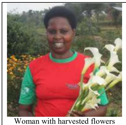
Woman with harvested flowers

Activities of flower production intensified in October as the rainy season started. The group applied manure to the flower garden and planted additional seeds/bulbs for the 2018 harvesting season. On October 31, a total of 22 members of PIASS Peace Club offered their helping hand to the women in the garden through carrying manure from its source to the garden and planting flower seeds/bulbs.