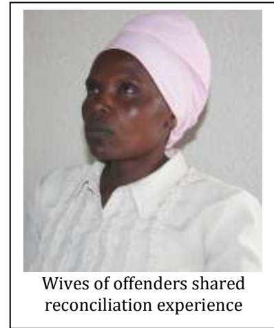
Wives of offenders shared reconciliation experience

For measures of reconciliation, there are several mechanisms that were established to deal with this issue of living together after the genocide. Among those was the establishment of National Unity and Reconciliation Commission, Ndi Umunyarwanda (I am Rwandan) program and others. All of these programs were established in order to encourage reconciliation and the restoration of the broken relationships among Rwandans.