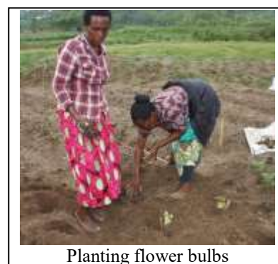
Planting flower bulbs

This is a follow up of the activities of Umucyo Nyanza (“Light of Nyanza”), a womens association working together in Nyanza for reconciliation and development. The group consists of 15 women coming from both sides of the genocide against the Tutsi in 1994 (survivors and wives of genocide perpetrators). Since October 2015, this group has been producing and selling flowers as their income generating activity. The objective of working together is that there is a need for restoring the broken relationships caused due to the genocide and to improve their economic condition by becoming economically self-reliant.