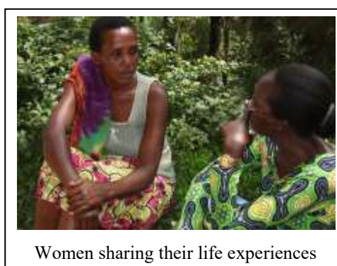
Women sharing their life experiences

This training was organized by CRASPD in collaboration with Christian Action for Reconciliation and Social Assistance (CARSA) and funded by Compelled by Love (CbL), an Australian NGO supporting healing and reconciliation initiatives for Rwandan people. The aim of the training was to equip the members of Umucyo Nyanza with knowledge and skills about trauma healing. This was the continuation of the trauma